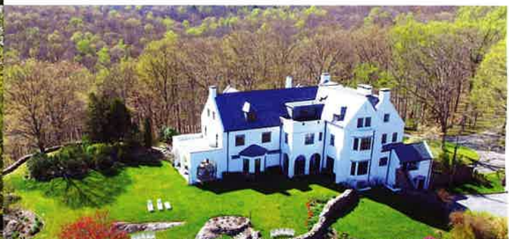
$5,400,000 Walker & Gillette designed mountain top manor in 1922 with breathtaking views of Tuxedo Lake.