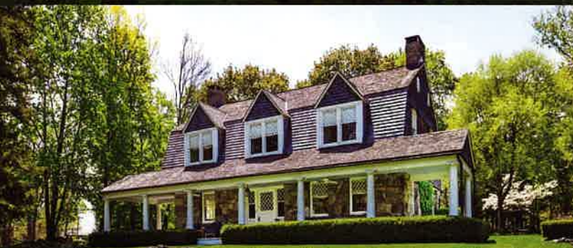
$1,975,000 Designed by Bruce Price, this exquisite "cottage" best exemplifies the community's unique history.