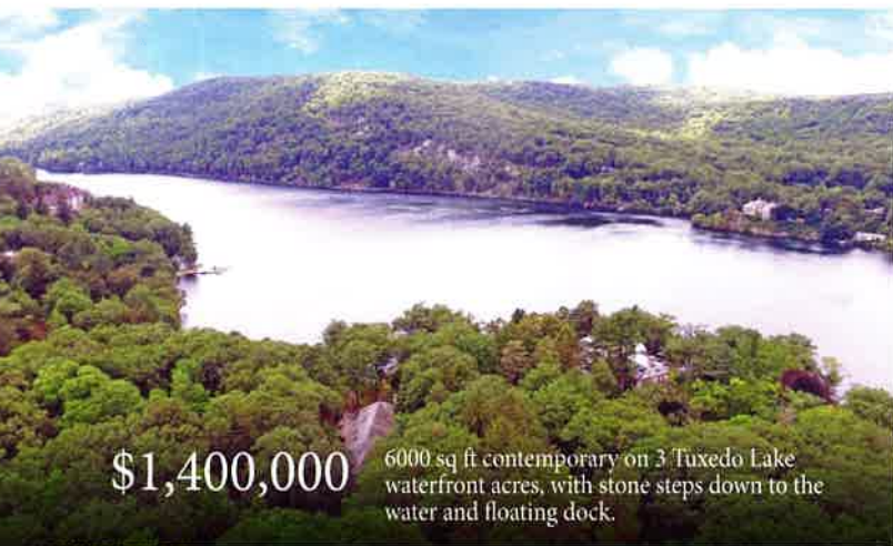
$1,400,000 6000 sq ft contemporary on 3 Tuxedo Lake waterfront acres, with stone steps down to the water and floating dock.

Tuxedo Hudson Realty was launched this March to take advantage of exciting real estate opportunities in the area. There are exceptional properties that were designed by the great architects of the day that can be purchased for a fraction of their replacement cost, in fact, within this book we are offering houses designed by Delano & Aldrich, Walker & Gillette, and Bruce Price.