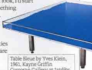
Table Bleue by Yves Klein, 1961, Kayne Griffin Corcoran Gallery at 1stdibs.