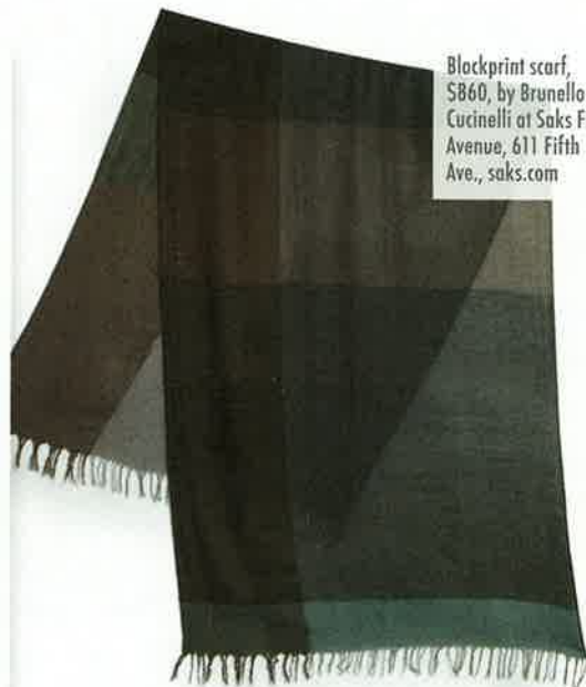
Blockprint scarf, $860, by Brunello Cucinelli at Saks Fifth Avenue, 611 Fifth Ave., saks.com

O'Connor suit in slate gray and black wool, $4,780, white and navy slim cotton shirt, $635, charcoal and marl gray geometric pattern wool tie, $255, charcoal, light gray and white geometric pattern silk pocket square, $160, all at Tom Ford, 845 Madison Ave., tomford.com