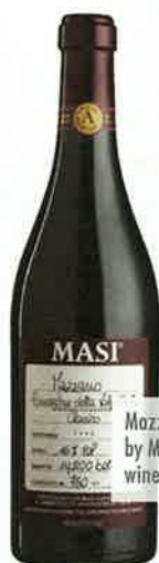
Mazzano wine, $110, by Masi Agricola at wine-searcher.com