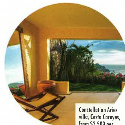
Constellation Aries villa, Costa Careyes, from $3,500 per night, careyes.com