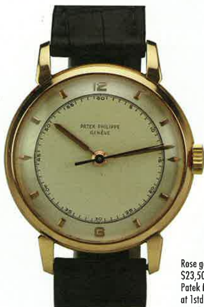
Rose gold watch, $23,500, by Patek Philippe at 1stdibs.com

"My style is casual elegance, the best of the basics."