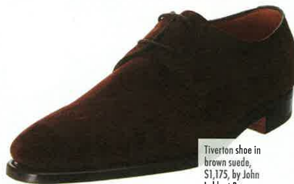
Tiverton shoe in brown suede, $1,175, by John Lobb at Barneys