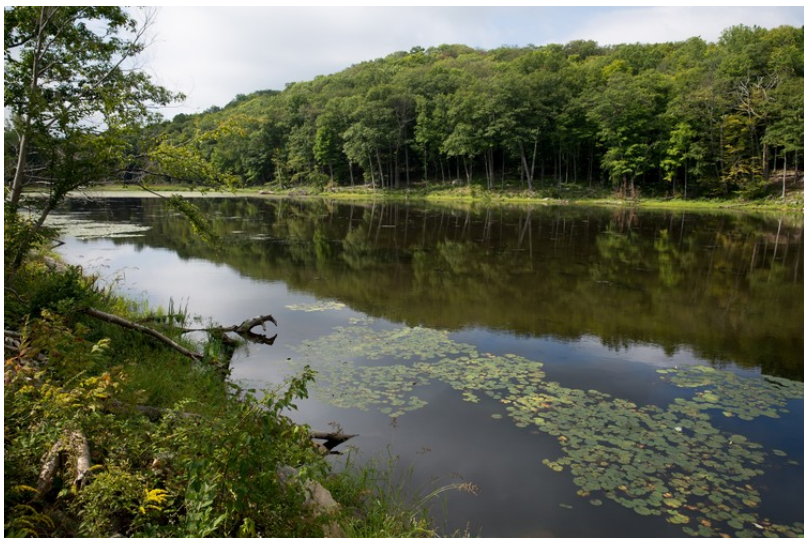
Four Corners Pond. More than 70% of Tuxedo is protected parkland.