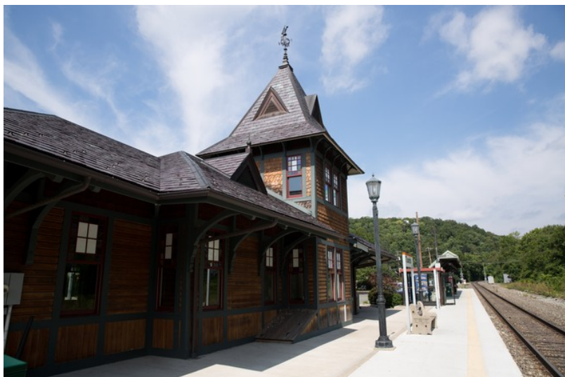
The Tuxedo rail station has recently been refurbished.