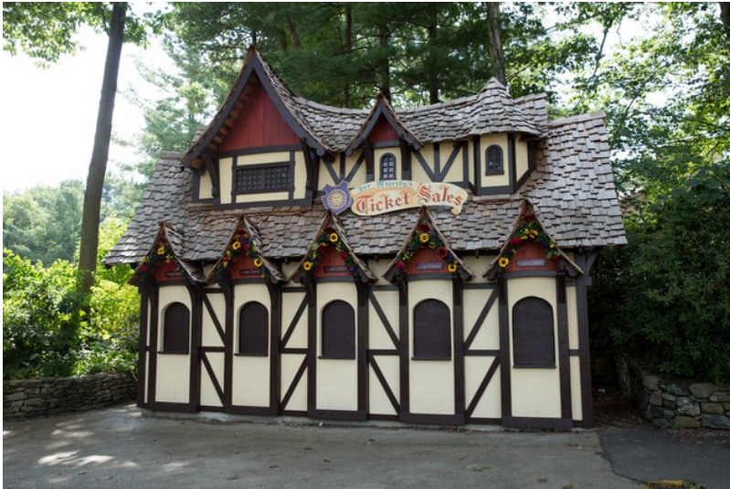
The ticket booth at New York Renaissance Faire on Route 17A in Tuxedo.

large state parks, Sterling Forest and Harriman, and more than 70% of the town is protected parkland.