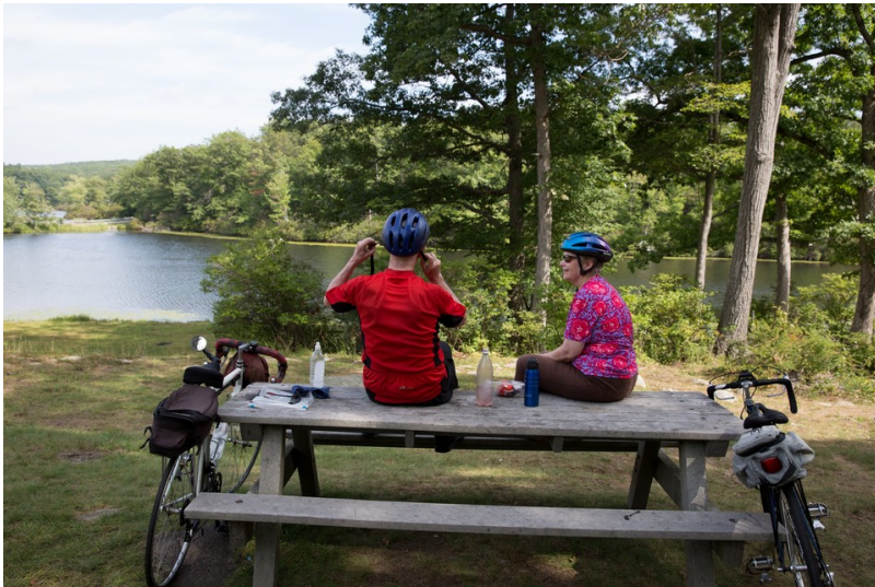
Cyclists take a break by Lake Kanawauke in Harriman State Park. Tuxedo is sandwiched between Harriman and Sterling Forest State Park.

Orange County town has parkland, a Gilded Age gated community, and now an entrepreneur plans to make it a destination for foodies