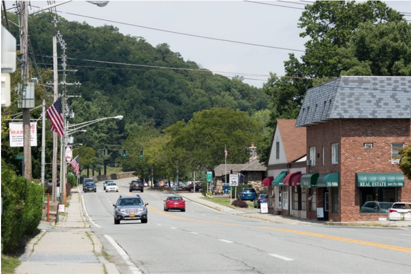
Businesses on Route 17 in Tuxedo

The sleepy town of Tuxedo is in the southeastern corner of Orange County, about 35 miles northwest of New York City. It is sandwiched between two