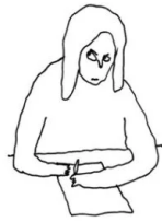
LIANA FINCK PASSING FOR HUMAN

1. WHAT WAS THE NAME OF YOUR FIRST LOVE'S FIRST LOVE?