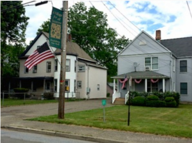
Part of the complex of properties recently purchased by the Tuxedo Hudson Company in Sloatsburg, NY — both may have originally been Waldron brother homes.