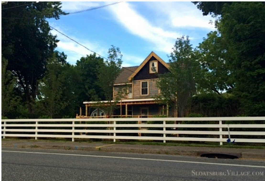
A section of newly installed white horse fencing in Sloatsburg that may become a signature visual feature for Tuxedo Hudson Company properties.