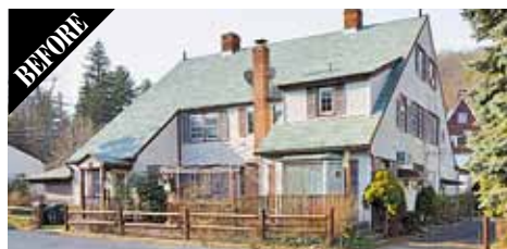
PHOTOS BY BILYANA DIMITROVA. RENDERINGS COURTESY OF DEGRAW & DEHAAN ARCHITECTS.