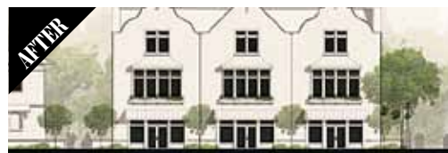
THE INN: An unassuming house will get a new lease on life as a quaint inn, hosting weekenders from New York City.