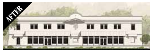
THE MARKET: A run-down convenience store will become a high-end food market and antiques emporium.