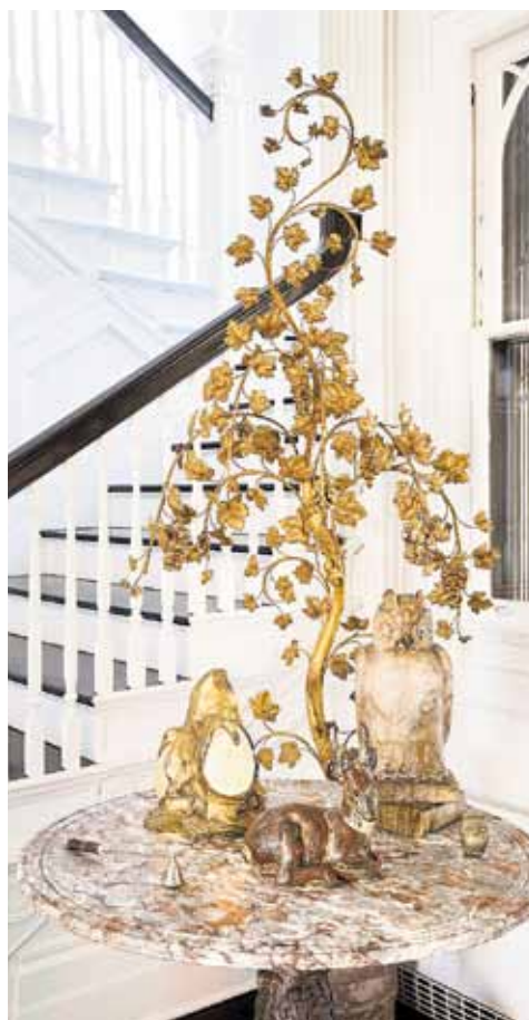
THIS AMERICANA LIFE TOP: Bruno’s breakfast room at his Tuxedo Park home is decorated with vintage chalkboards and display cases — mixed-and-matched with sleek, mod seating.