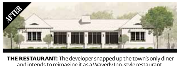
THE RESTAURANT: The developer snapped up the town's only diner and intends to reimagine it as a Waverly Inn-style restaurant.