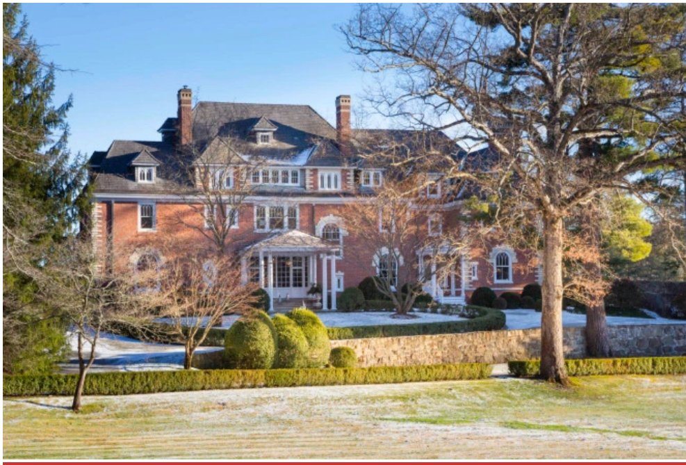
Bruno's sylvan, lakefront, 120-acre estate in Tuxedo Park abuts the 22,000-acre Sterling Forest preserve and the roughly 50,000-acre Harriman State Park.

Photo: PHOTOS BY BRETT BEYER. PROP STYLIST BRICE GAILLARD.